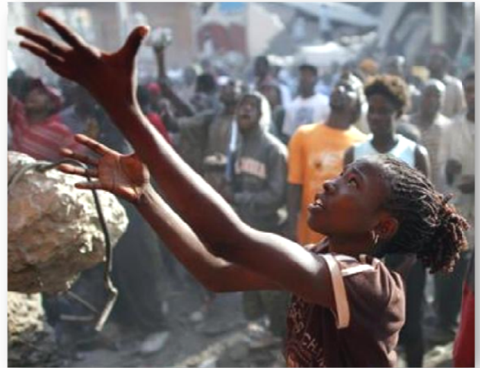
A girl reaches out for food in downtown Port-au-Prince, Haiti. JAN 2010