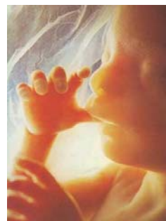
Unborn at 16 weeks old.