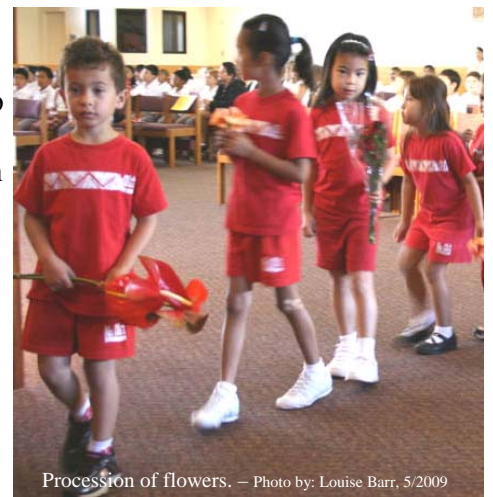
Procession of flowers.

Congregation of the Sacred Hearts of Jesus and Mary