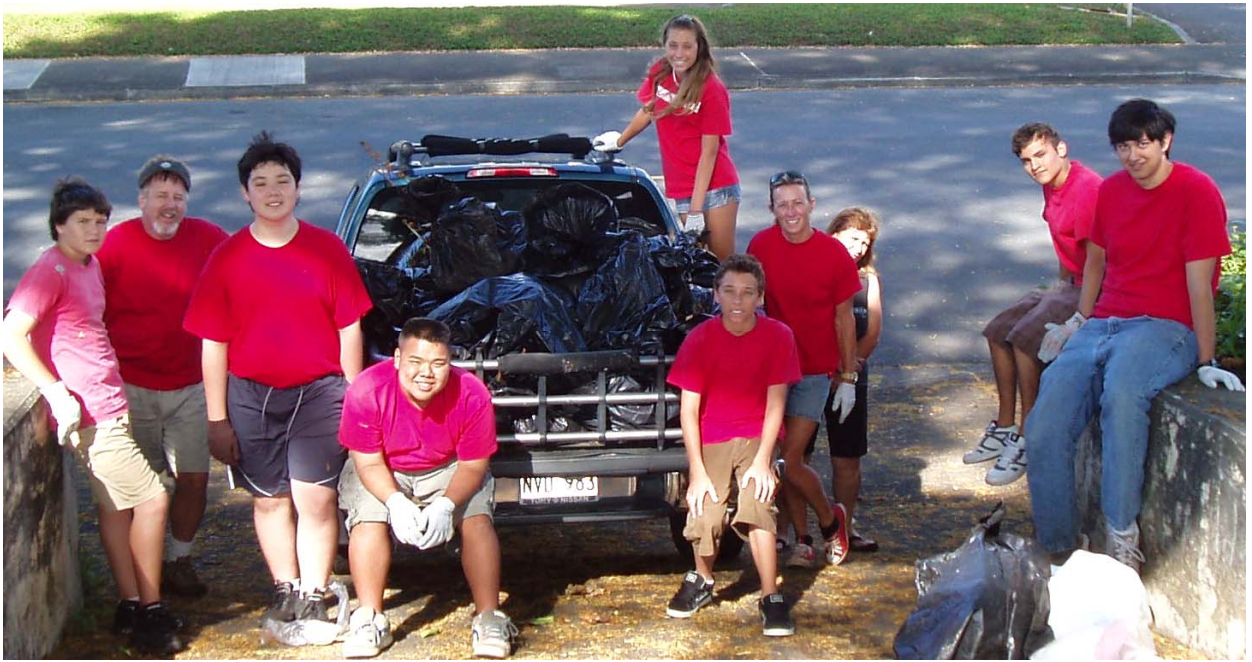
Boy Scouts, Leaders & parents volunteer to clean St. Ann's Cemetery for their service project and haul out another 900 lbs. of trash. Great job! A Big Mahalo to everyone who helped!

On Saturday, May 23, 2009 St. Ann's Boy Scouts Troop 113, Scout leaders and several parents held another clean-up workday at St. Ann's cemetery because they noticed that since their first effort in February, it wasn't long before mischief makers began