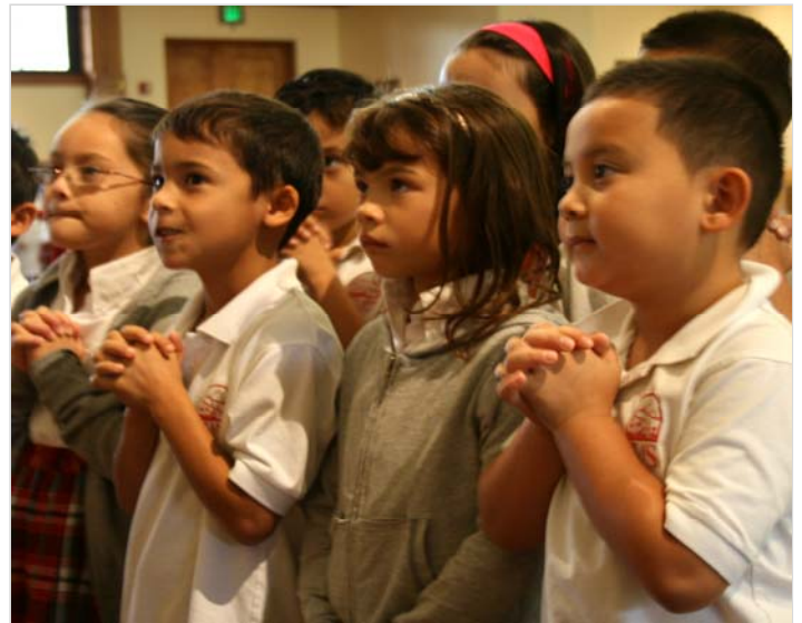
St. Ann's students make time to thank God in prayer at a special Mass in Honor of Fr. Damien.