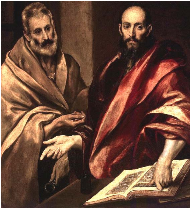
Sts. Peter & Paul – Artist El Greco – Spain circa 1587.

The New Testament clearly shows Peter as the leader of the Apostles, chosen by Jesus to have a special relationship with Him. With James and John, he witnesses the Transfiguration, the raising of a dead child to life and the agony of Gethsemane. Jesus sends him along with John to prepare for the last Passover. He plays a major role in the events of the Passion. The Church recognizes Peter as the Prince of the Apostles.