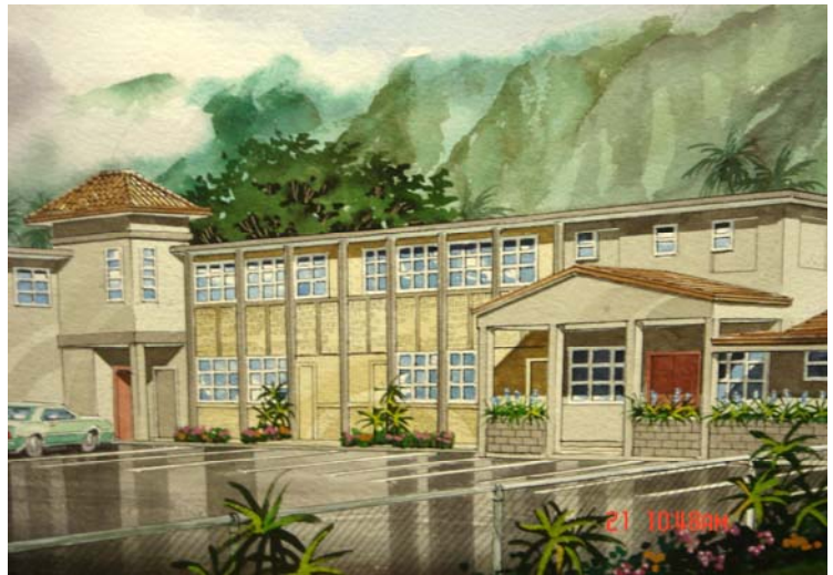
Architectural rendering of the New Parish Center – NOV 2008

This campaign, entitled " With Grateful Hearts ", is a wonderful opportunity for St. Ann's to address needs here at our parish and stand in solidarity with other parishes throughout our Diocese.