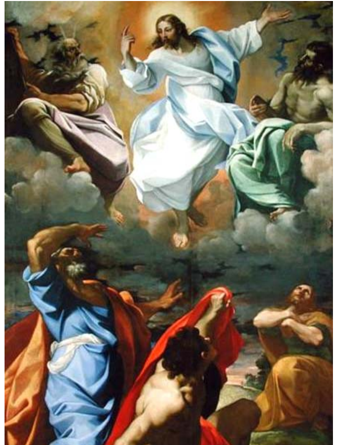
The Transfiguration – Lodovico Carracci 1594

Catholic Tradition has it as literally happening on Mount Tabor. Some modern scholars, together with the ancient gnostics, believe the Synoptic Gospels should be understood allegorically. For these scholars, Moses and Elijah represent the Law and the Prophets. Their conversation with Jesus symbolizes how Jesus fulfills "the law and the prophets" (Matthew 5:17-19.)