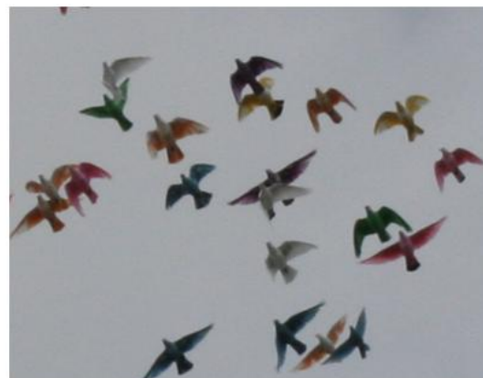
The faculty, staff and students of St. Ann's Model Schools gather and release rainbow pigeons as a symbol of the journey we embark on as we begin the new school year.