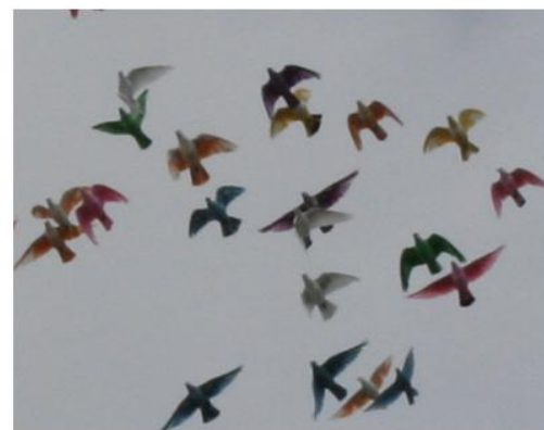
The faculty, staff and students of St. Ann's Model Schools gather and release rainbow pigeons as a symbol of the journey we embark on as we begin the new school year.